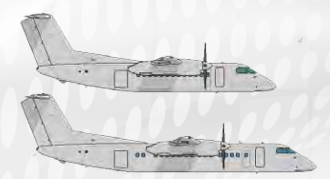
The VMS II is FAA STC certified for use on 100, 200, and 300 Series Dash 8 aircraft